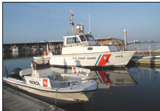
'TEAM COAST GUARD'

Active members, Reservists, and the volunteers of the Coast Guard Auxiliary working together.