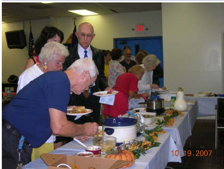
October's offerings included sausage appetizers, and sweet potato and squash dishes in keeping with the season. Main courses included chicken and beef dishes, and the dessert table was laden with cakes and pies.

The Family night event on October 19th at Flotilla 79 was well attended. Why should we headline fellowship when the Flotilla's members participate in Recreational Boating Safety initiatives, Member Services and Operations and Marine Safety? Because Fellowship is the fourth cornerstone of the Auxiliary, and serves a most vital function.