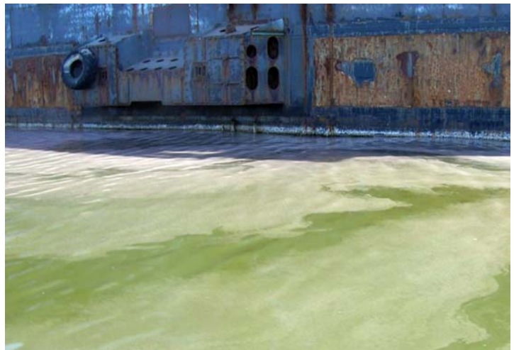
Photographic images can be as beautiful and as interesting as any painting. This subject is unusual, and both the colors and the light create a harmonious composition. Betty Hagan took this photograph while conducting a harbor patrol.

No Family Night in November due to the Thanksgiving holiday. See ya'll in December!