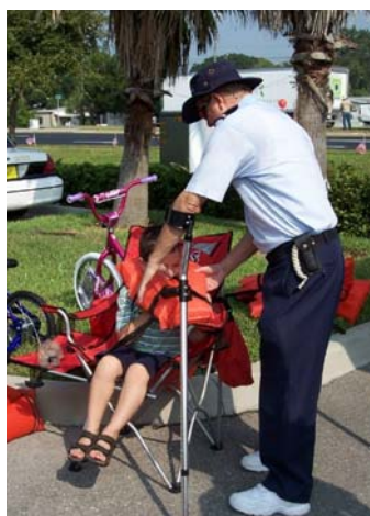
Bradley shows a child how to properly wear and adjust a PFD.

Department in Tampa. The fair was organized to address many safety issues, particularly tips on how to prevent child abductions and the dangers of sexual predators. Sea Partners presented information on how to