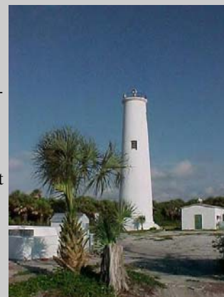
Egmont Key Lighthouse

Coxswains should recall that we are required to have the Light List on our facilities. The entire 2005 Light List for our District is difficult to obtain in print, and has far more information than we need for our operational area. A shorter version that meets the basic requirement can be obtained via the Flotilla web site: http://www.cgwebs.net/flotilla79/ . Click on the vessel safety check tab, go to the bottom of the page, and click on Light List. This will bring you to the NOAA site. Click on District 7, or Florida, on the map, and the appropriate light list will open in your browser. Print the following pages: 198 thru 211. You may print each page individually by using 'Print Current Page' command, or you can print the range of required pages. Be careful...don't print the whole light list or you will run out of paper and ink! While you are at it, review the first few pages of the list for general information.