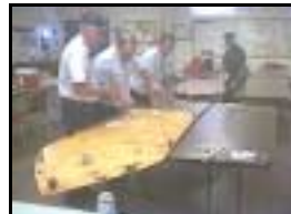
79ers in a recent crew class use Miss 79er and Deadboat to learn towing skills.